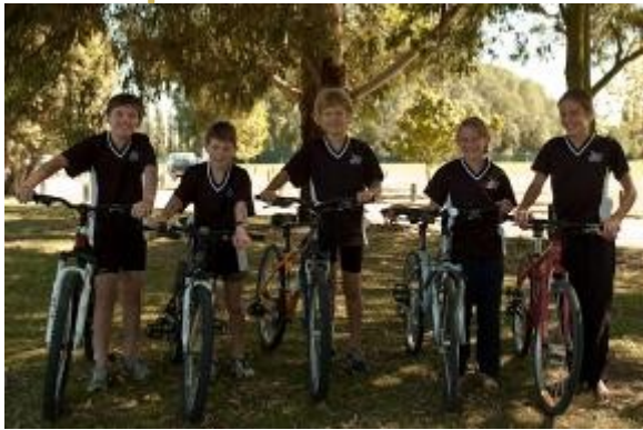
Primary Schools Triathlon held at QEII